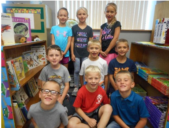
1 st & 2 nd

We are off to a great start with lots of exciting learning going on! Don't forget to check our website too.